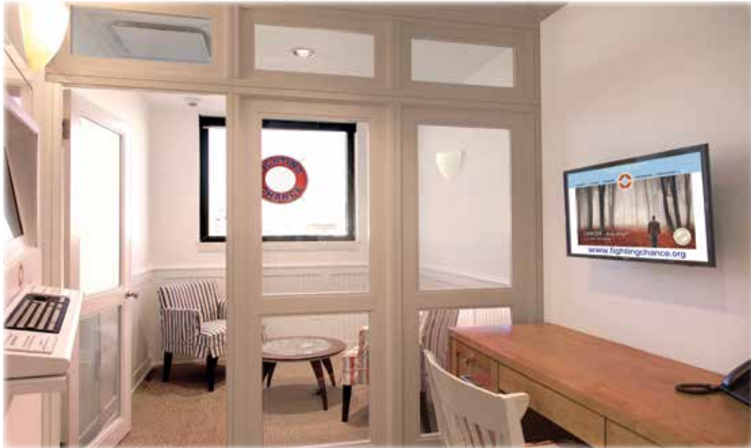
Suite 102, The Fighting Chance Office at The Phillips Center

The Patient Counseling Office for Fighting Chance also is located on Level 1, down the hallway from Radiation Oncology. The technical term for the services provided is Psycho-Oncology which aims to help patients cope with the many psychological and emotional challenges of a cancer diagnosis. They include a profound sense of disorientation, paralyzing fear, hyper-anxiety, sleeplessness and depression.