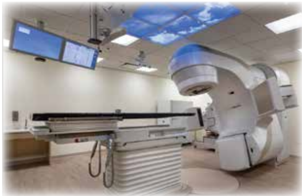
Radiation Treatment Center at Phillips

An elevator takes us to Level 1 ; the space is largely dedicated to Radiation Oncology . It houses a state-of-the-art linear accelerator. The treatment starts with taking a high definition 3-D image of the area to be treated, permitting pin-point accuracy for the radiation beam targeting the patient's lesions.