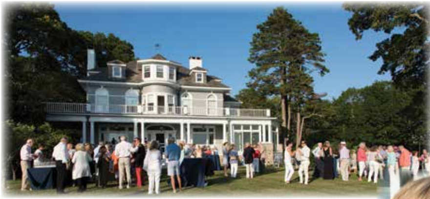
Guests gather on the lawn of the Ressler House in Dering Harbor