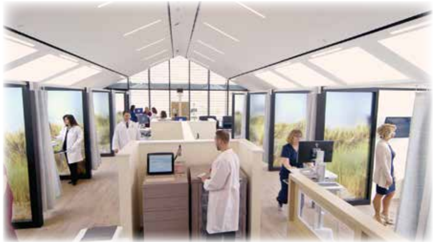
Chemo Suite at The Phillips Center

The dominant feature of Level 2 is a massive Chemo Suite with 14 infusion stations. Before progressing to the Chemo Suite the first stop is a Patient Registration & Waiting Area .