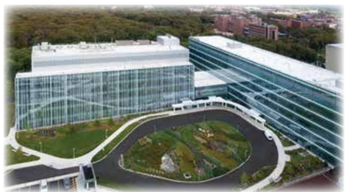
The Cancer Center at Stony Brook is incorporated into the 10-story MART Building recently completed at a cost of nearly $200 million.

The MART also provides a unique resource of knowledge that can be accessed by oncologists at The Phillips Center.