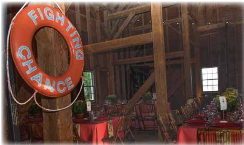
The Barn welcomes 180 guests for farm-to-table dinner