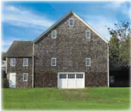
Wesnofske Barn on Scuttlehole Rd

Your Hosts . . . Eleven Directors of Fighting Chance