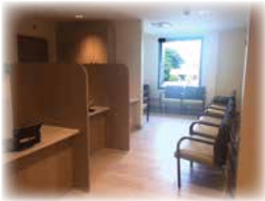
Level 1 Patient Registration