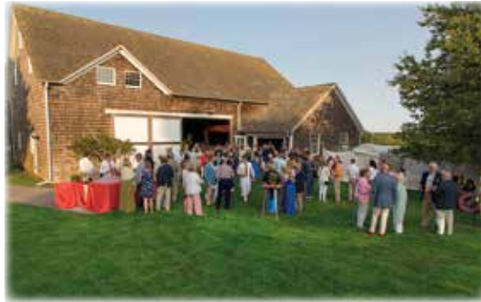
Cocktails on the Lawn