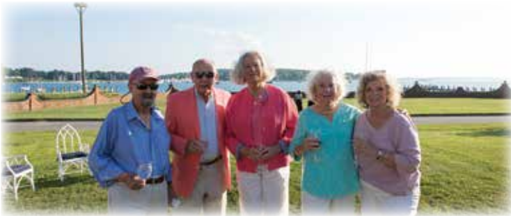
A group of Shelter Island Friends