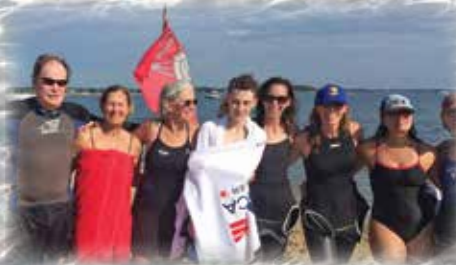
Mother, Daughters & Friends