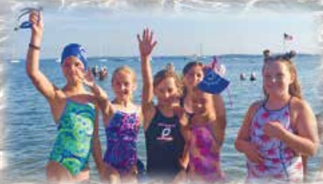
Teenage Swim-team . . . at the Finish Line