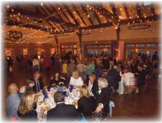
Guests enjoying dinner at Maidstone