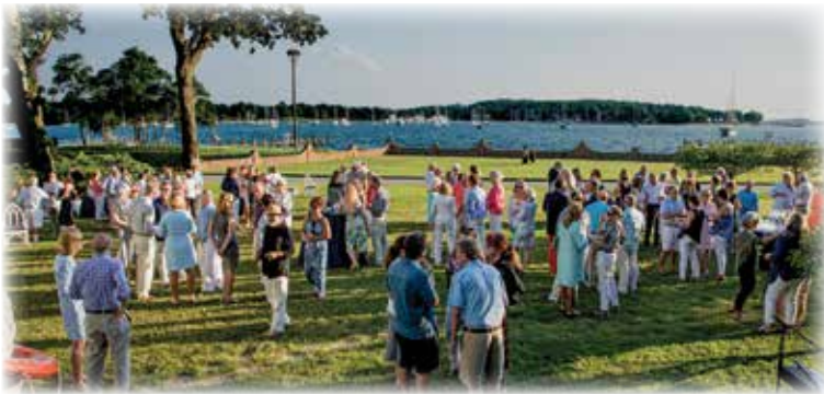
Guests gathering on the grounds of the Ressler Estate