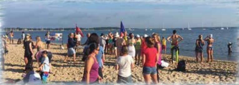
Charity Swim 2017 Gets Started . . . 70 swimmers at Haven's Beach in Sag Harbor