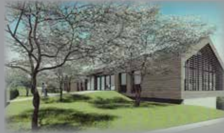
Architect's depiction of the New Cancer Center Southampton, NY