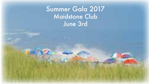
Summer Gala 2017 Maidstone Club June 3rd